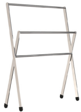
01977 » Polished