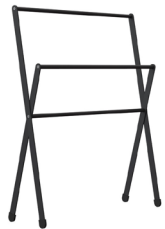
N1977-B » Matt Black

Materiale: Stainless steel, AISI 304 Design: Bønnelycke mdd Manufacturer: FROST A/S, Bavne Alle 32, DK-8370 Hadsten